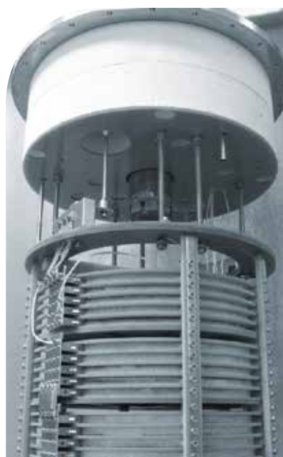
FCL Coil with AMSC's Amperium Stainless Steel Wire.

Manufactured using a high-volume and proprietary process, AMSC's stainless steel laminated wire is available in 12 mm width. The wider, higher current wire is designed for high power distribution and transmission level current limiters.