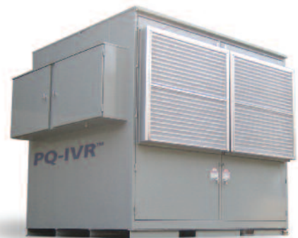
The PQ-IVR device instantaneously injects precise amounts of reactive power into a network.

While many systems such as uninterruptible power supplies (UPS) have been used to directly carry small loads through a voltage sag, the American Superconductor PQ-IVR® (Power Quality Industrial Voltage Restorer) system is available to correct sags for an entire industrial plant with loads of 5MW or greater. The PQ-IVR system utilizes proprietary shunt-connected inverters to correct voltage sags and swells at the industrial load. In October 2004, Micron installed an American Superconductor PQ-IVR solution for voltage sag protection at its Idaho facility. ECI, Inc. a strategic