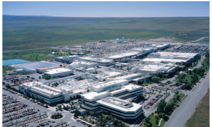
Boise Campus: Micron's corporate headquarters and first semiconductor manufacturing facility is located in Boise, Idaho. Beginning as a four-man semiconductor design company in 1978, Micron is now an international, multi-billion-dollar operation.

With millions of dollars of work in progress and hundreds of millions of dollars of process equipment on the manufacturing floor, momentary voltage sags can quickly bring production to a standstill. American Superconductor offers semiconductor manufacturers and other industrial companies a low-cost and effective solution with a rapid return on investment. PQ-IVR systems ensure that manufacturing operations continue uninterrupted. PQ-IVR systems can correct single-, two- and three-phase sags for the largest of loads and continue to provide the same effectiveness even if loads increase over time.